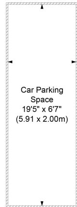
(NOT SHOWN IN ACTUAL LOCATION/ORIENTATION)